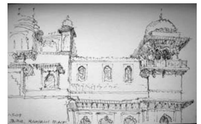
Above: Rambagh Palace, Jaipur, Rajasthan