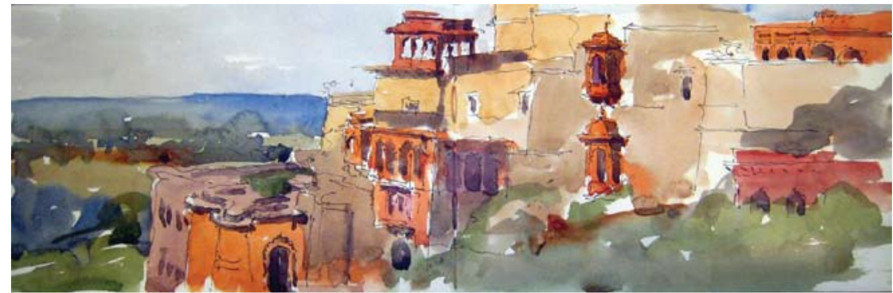
Below: Neemrana Fort Palace, Rajasthan

The current portfolio is from a journey to some of the less well known places of Rajasthan in northern India. Our group had all previously visited the more famous places (like Udaipur, Jaipur, etc.), so this trip took us to a series of princely states, each with its own distinct identity and often a spectacular palace turned into a magnificent hotel.