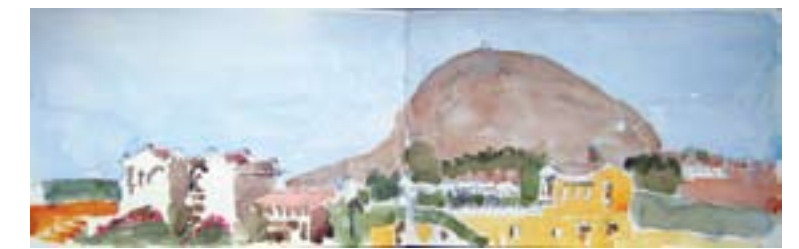
Above: Narial, Rajasthan as viewed from Rawla Hunting Lodge