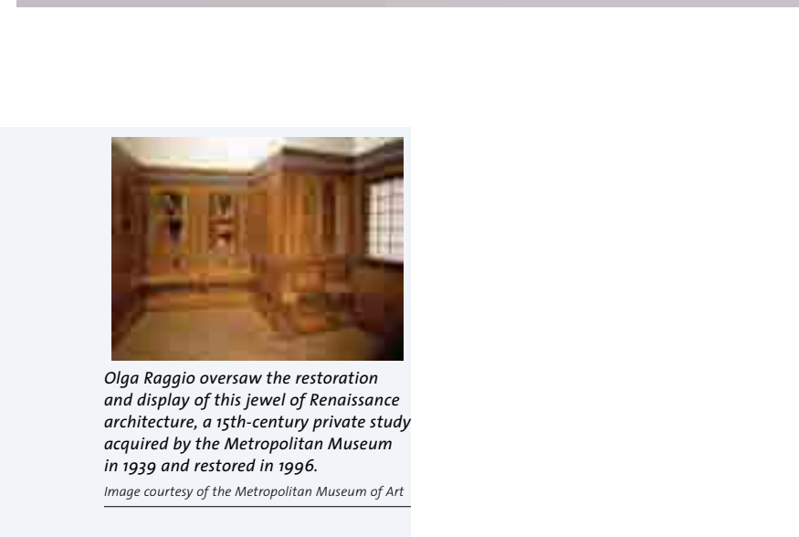
Olga Raggio oversaw the restoration and display of this jewel of Renaissance architecture, a 15th-century private study acquired by the Metropolitan Museum in 1939 and restored in 1996.