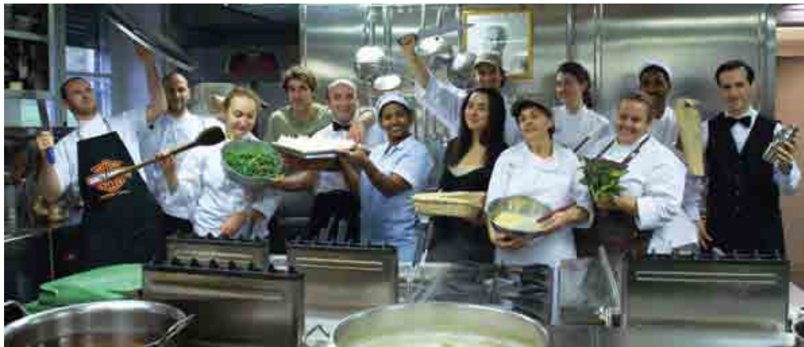
Right: The kitchen staff cuts up, fall 2008.