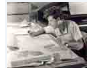
Lukas Foss in his Casa Rustica studio at the AAR, ca. 1951.

"A five-note chord dominates the composition. It is endlessly repeated, varied, permuted, transposed and inverted. It invades the entire piece via persistent, pulsating, echoing and crisscrossing quarter notes. Toward