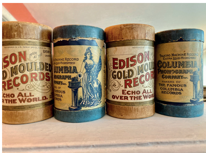
Containers for Wax Cylinders, early twentieth century Wax phonograph cylinders Collection of the artist (artwork © William Dougherty)