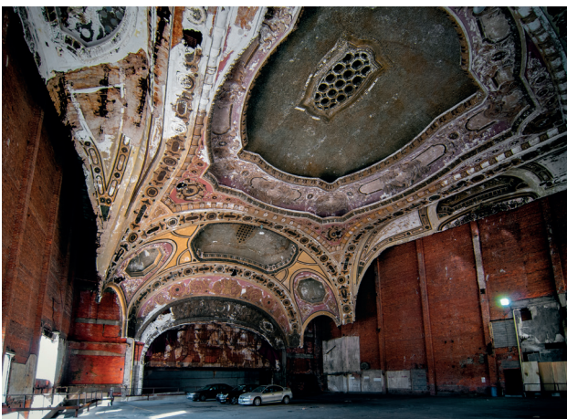
Michigan Theatre , 2021 Archival pigment print 60x45 cm (artwork © Julia Solis; photograph courtesy of the artist)