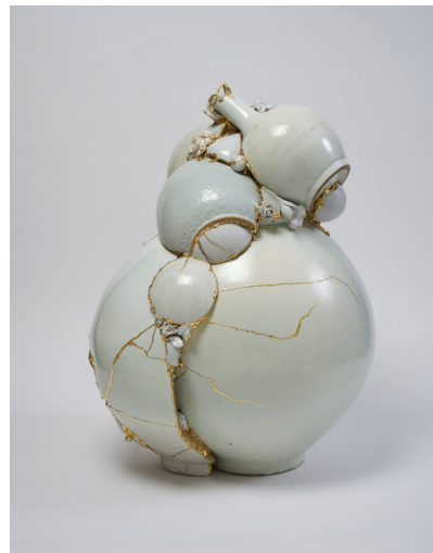
Translated Vase_2019 TVCW 3 , 2019 Ceramic shards, epoxy, 24k gold leaf 63x41x46 cm Unique piece (artwork © Yeesoookyung)

There is, in this work, a deep consideration of value and of the ethics of preservation. Yeesoookyung questions canons of beauty – why one thing is discarded while another is preserved, for example – as well as what is meant by “restoration.” Is it a particular form that is being restored? A function? Or might it be something more abstract, like beauty or strength? Her “translations” prioritize mutability over permanence, treating fragility as a virtue. Or as she put it in a 2020 interview: “My work can be seen as a glorification of the fateful weakness of being.” (ER)