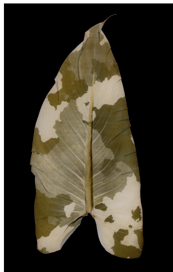
Military Foliage #7 , 2010 Chlorophyll print and resin 40x24 cm (artwork © Binh Danh)