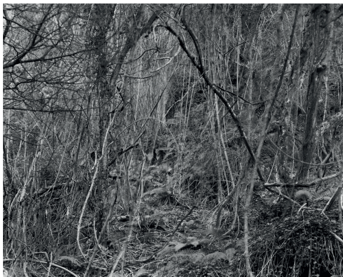
The Structure of a Forest #12 , 2021 Archival pigment print 155x192 cm (artwork © Fabio Barile)