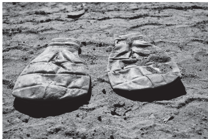
Empreinte_16 , 2009 Gelatin silver print 100x70 cm (artwork © Georges Senga)