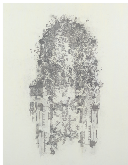
Encyclopédie III , 2010 Acrylic and graphite on canvas 196x151 cm (artwork © Guillermo Kuitca)