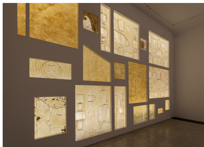
Distributed Monuments , 2022 Latex and dust transferred from the American Academy in Rome 912x591 cm (artwork © Jorge Otero-Pailos; courtesy of the American Academy in Rome and Sapar Contemporary. Photograph by Daniele Molajoli)